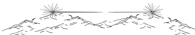
Operation On Target - A Varsity Scout Mountain Top Experience!